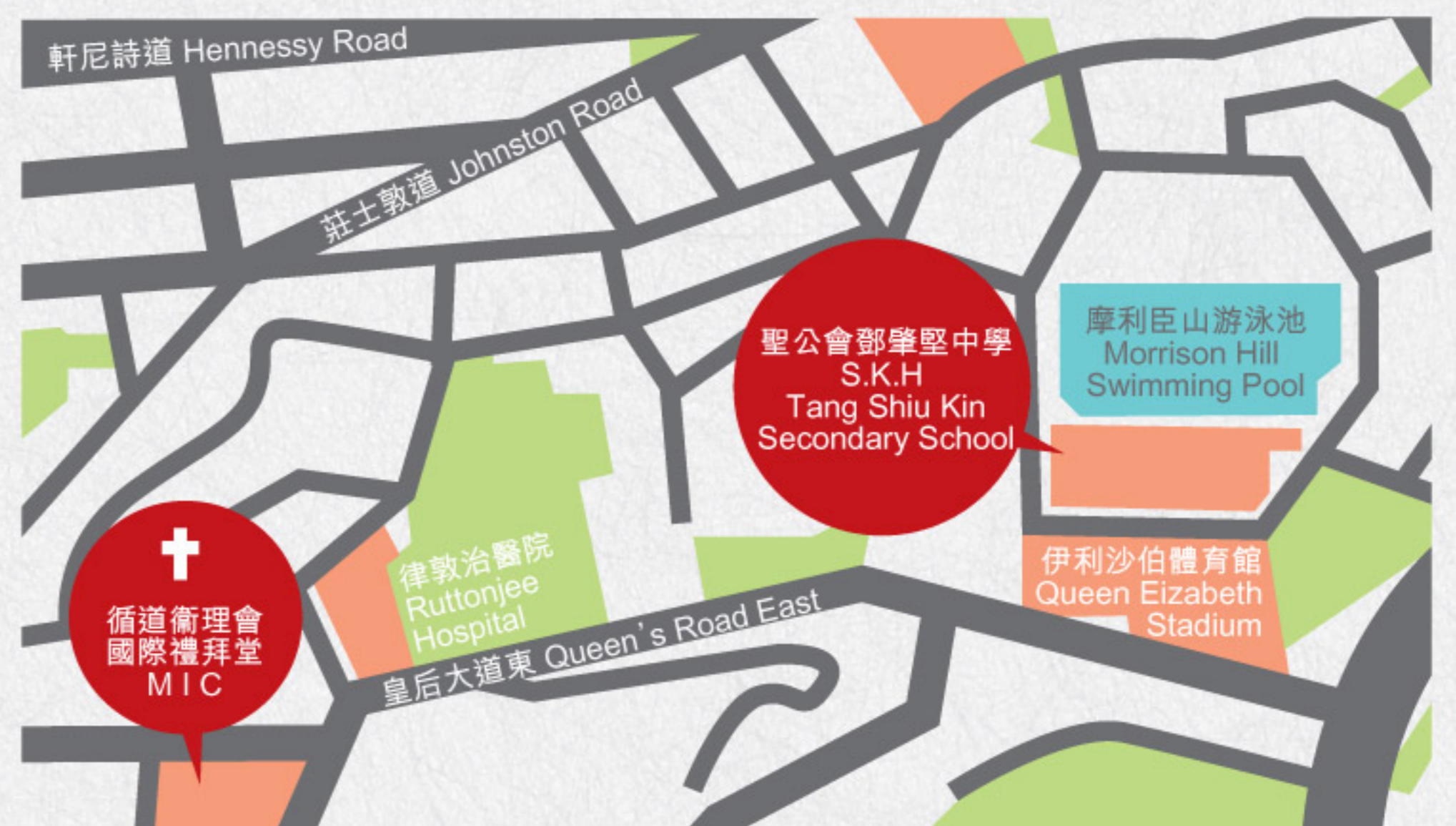
MIC worshipping at SKH Tang Shiu Kin Secondary School, 9 Oi Kwan Road, Wan Chai.