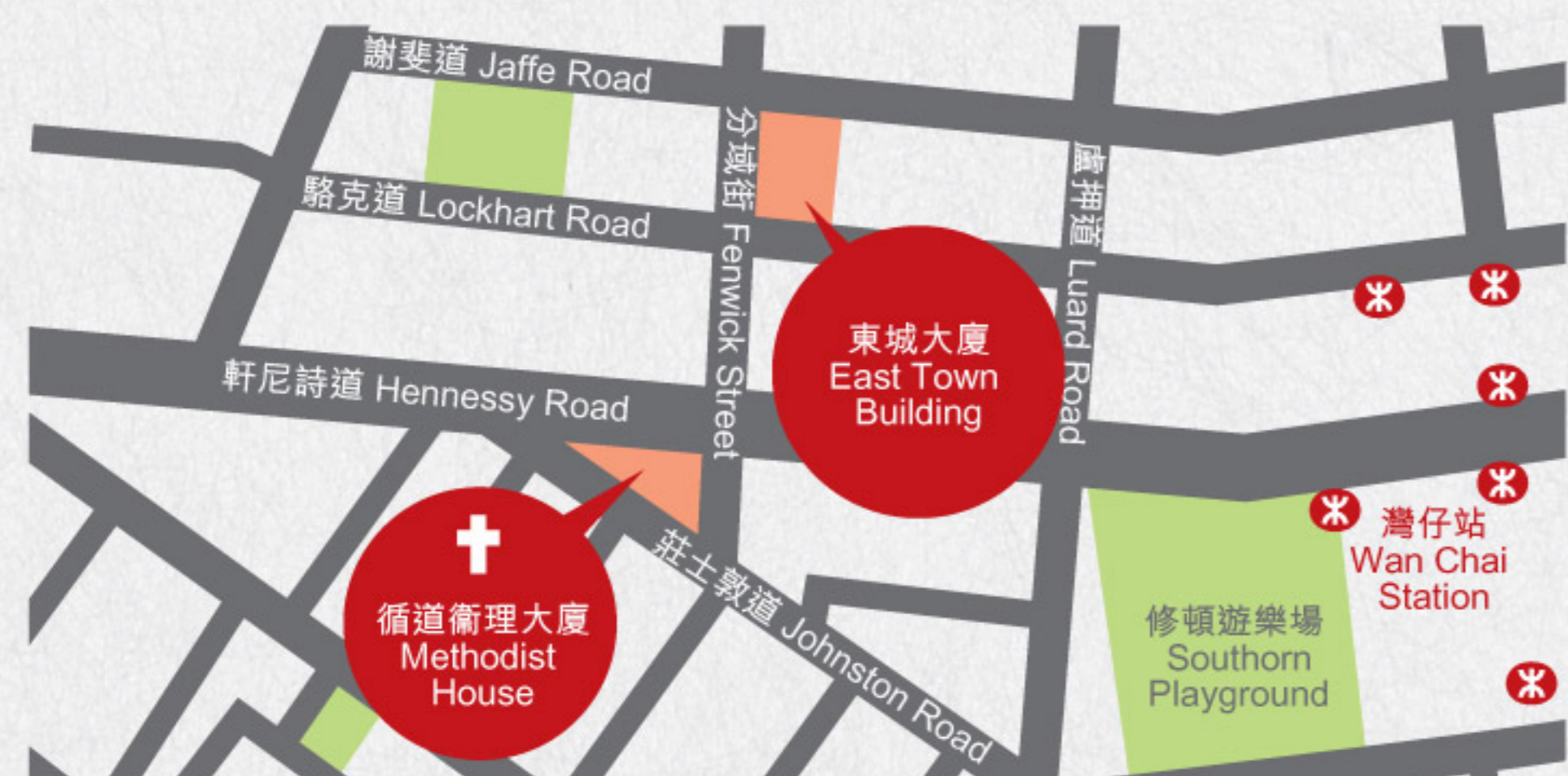
Our New Office : MIC Ministry Centre, Room 801, 8/F East Town Building, 41 Lockhart Road, Wan Chai. Phone numbers, email and web address remain the same